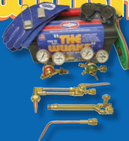
WURKS-V [TUBE MIX] UPC# 82160