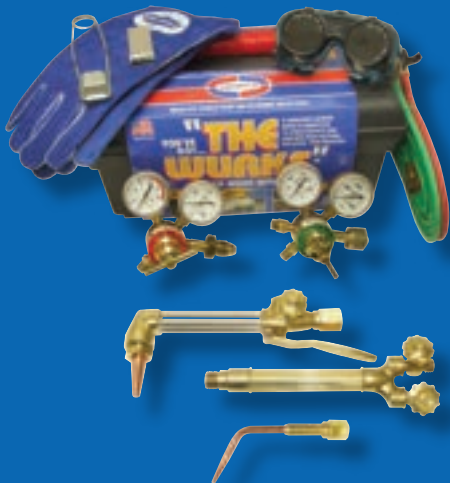
WURKS-A [TIP MIX] UPC# 88004