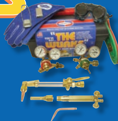
WURKS-H [HEAD MIX] UPC# 85005